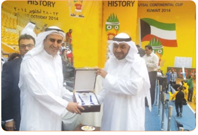
• Handing a memorial shield to ACICO by the championship administration