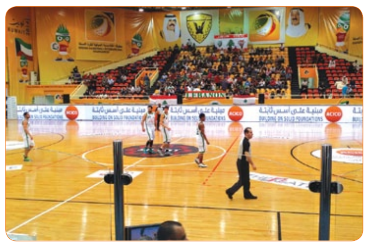
• Portion of the matches