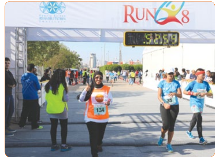
• The competitors arrival to finish line